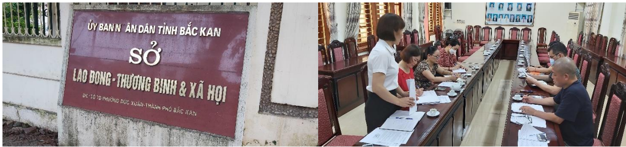
DOLISA Bac Kan province