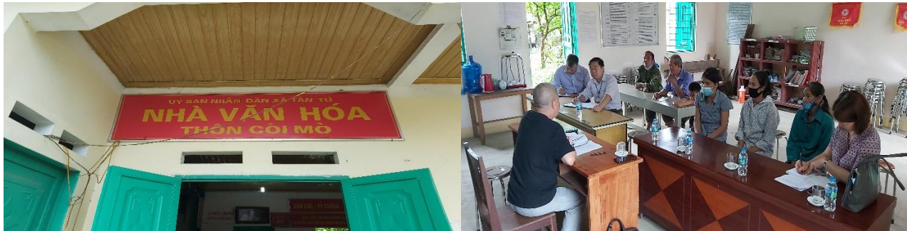
Tan Tu commune's public hall